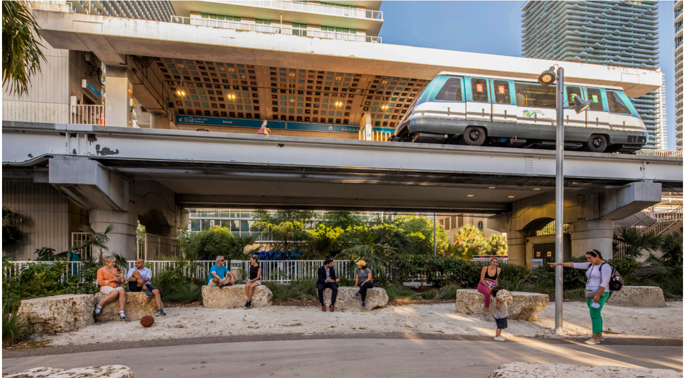
Multimodal transportation in the Brickell Backyard Oolite Room