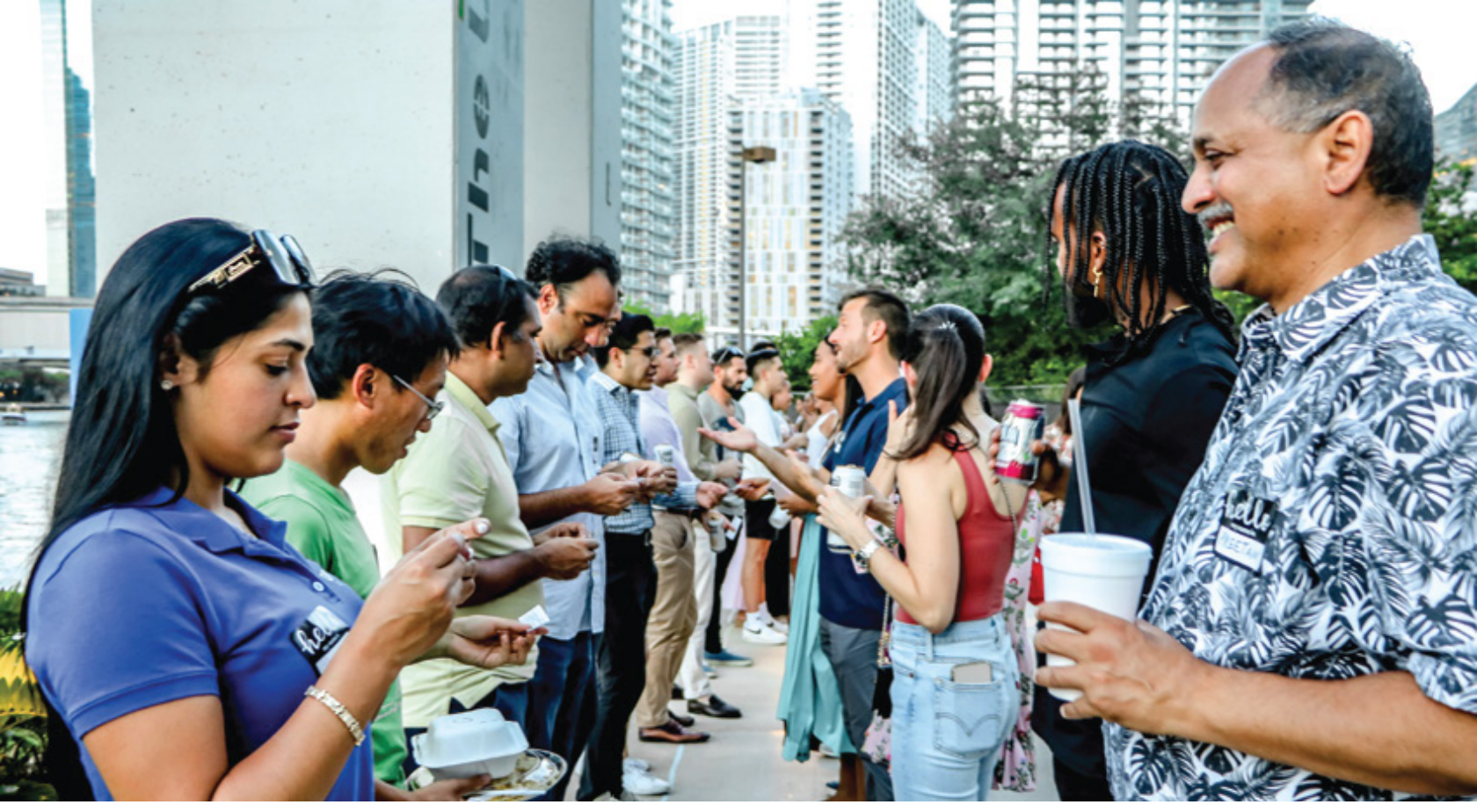
Community Connections: Speed Friending activation in the River Room