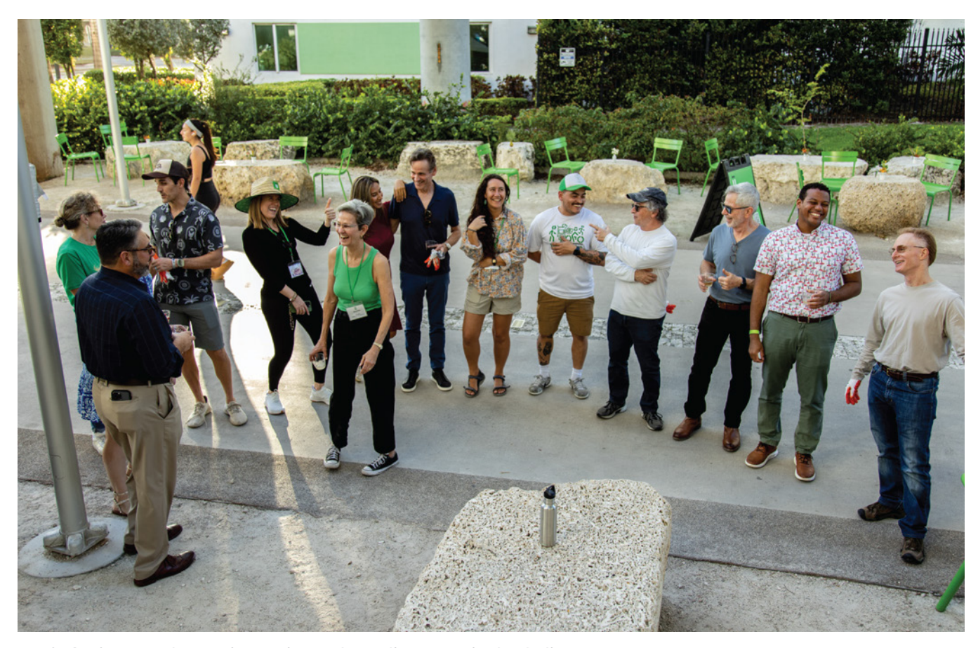
Atala Society members enjoy a wine and weeding event in the Oolite Room