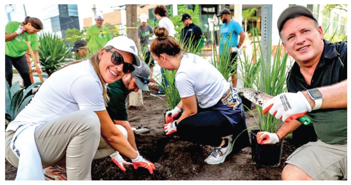
TD Bank volunteers beautify gardens in the Brickell Backyard Promenade

We celebrated a milestone this past fiscal year by receiving over 4,000 community service hours from 279 volunteers! Their dedication significantly impacted our operational capacity and fostered a more engaged and connected community.