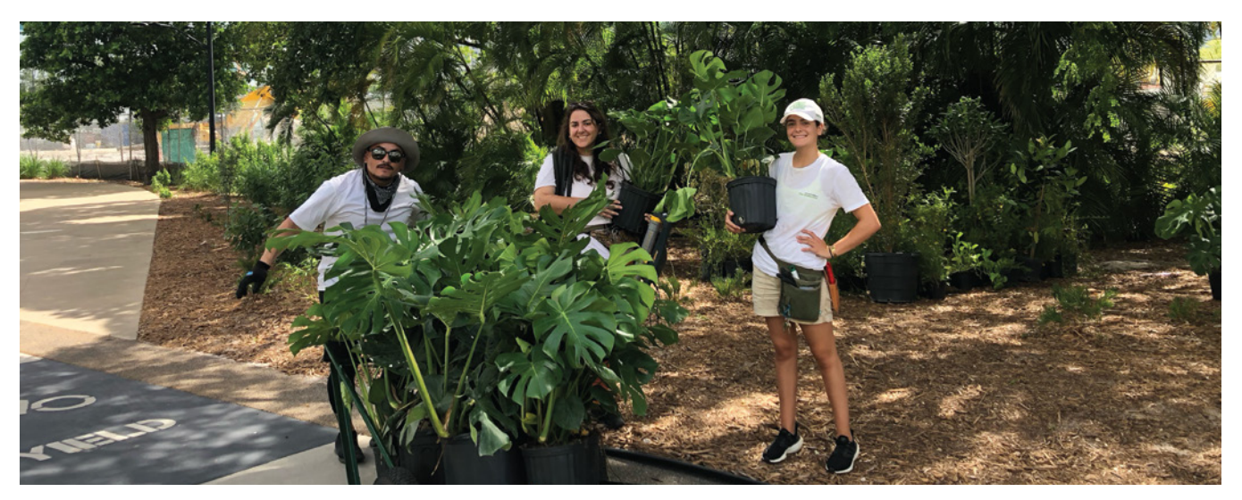
The Underline Green Leaders tending Brickell Backyard native plants