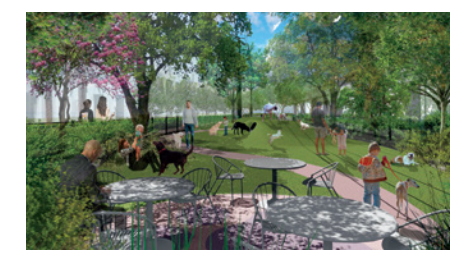
Bark Park Ponce de Leon Blvd and Le Jeune Rd