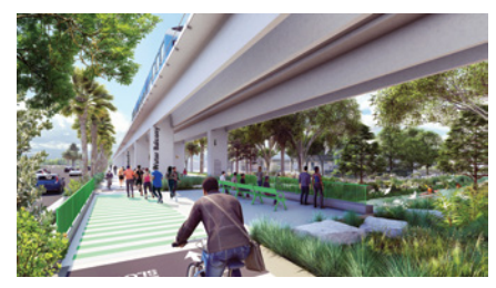
Water Balcony Coral Gables Waterway and Riviera Drive